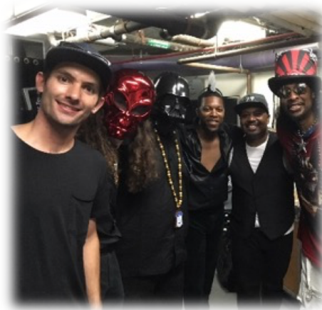
Backstage with William “Bootsy” Collins at his concert in Los Angeles.